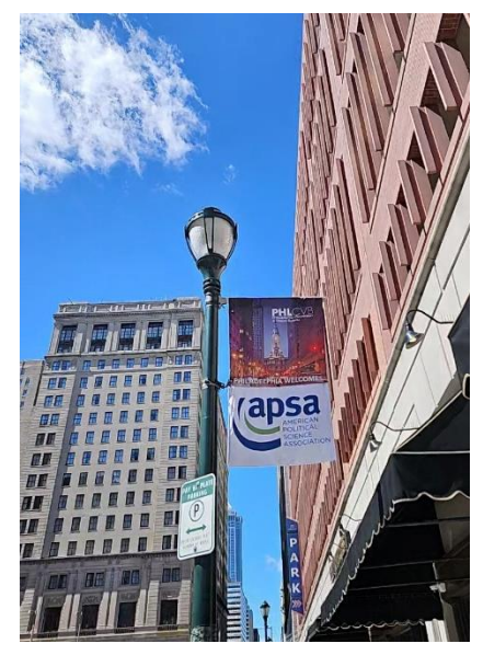
Fig 1. Philadelphia welcomes 2024 APSA participants

In addition to our presentation, there were discussions on topics such as local agenda setting after disaster events, the threat of natural hazards and its impact on marriages in Latin America, and a case study on postearthquake recovery in Nepal.