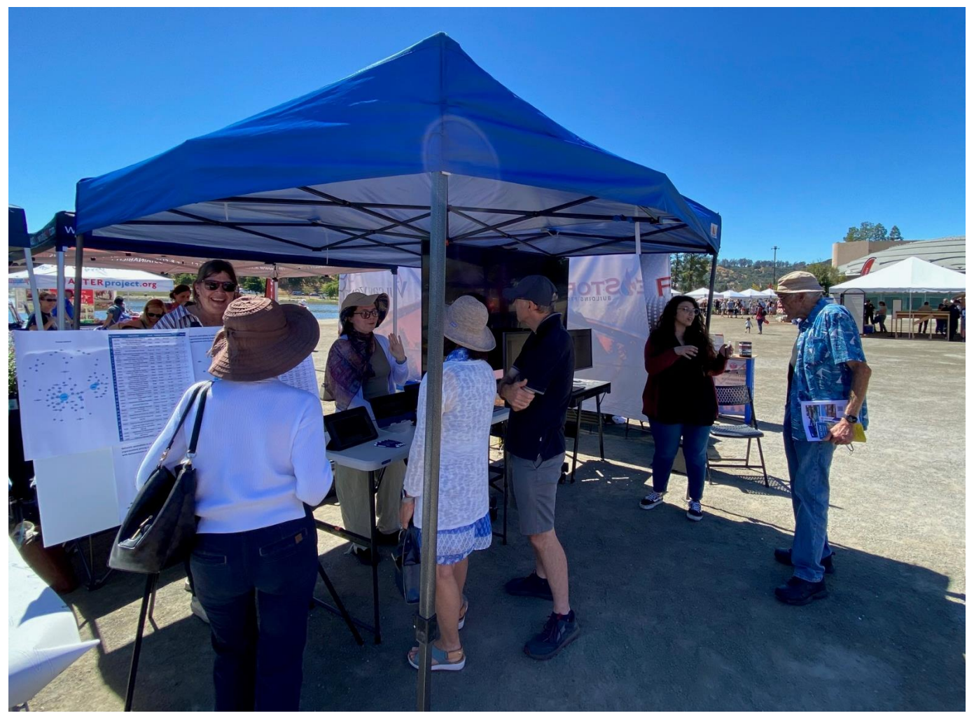
Fig 6. Engaging with residents at our booth.